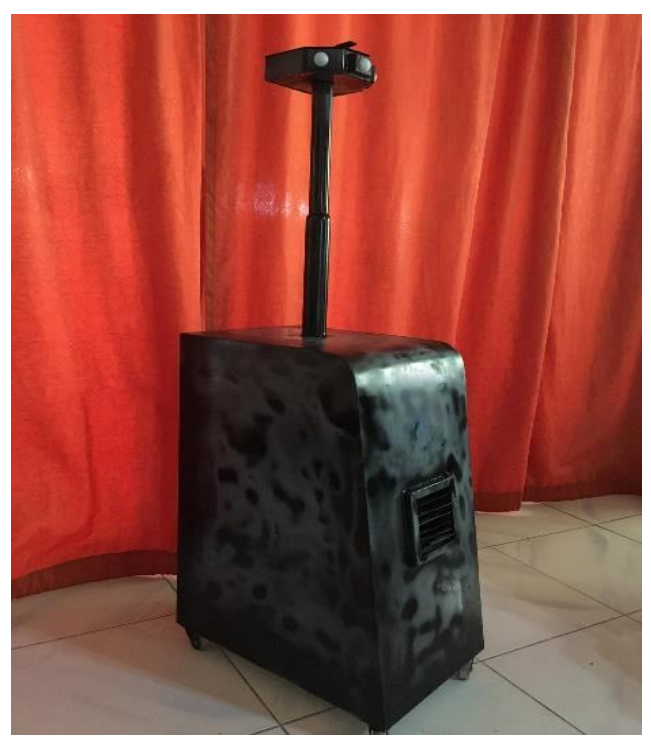
Fig. 3. The AUDI System.

The output project was made out of a galvanized iron sheet coated in ultra-thin fluid film compound paint for its anticorrosion purposes. The sensors were placed at the top of the machine to maximize its efficiency in detecting motion regardless of its position within the room. It has a vent that is directly panned over to the nozzle to ensure that the fog will not enter the system. The electrical elements and the different